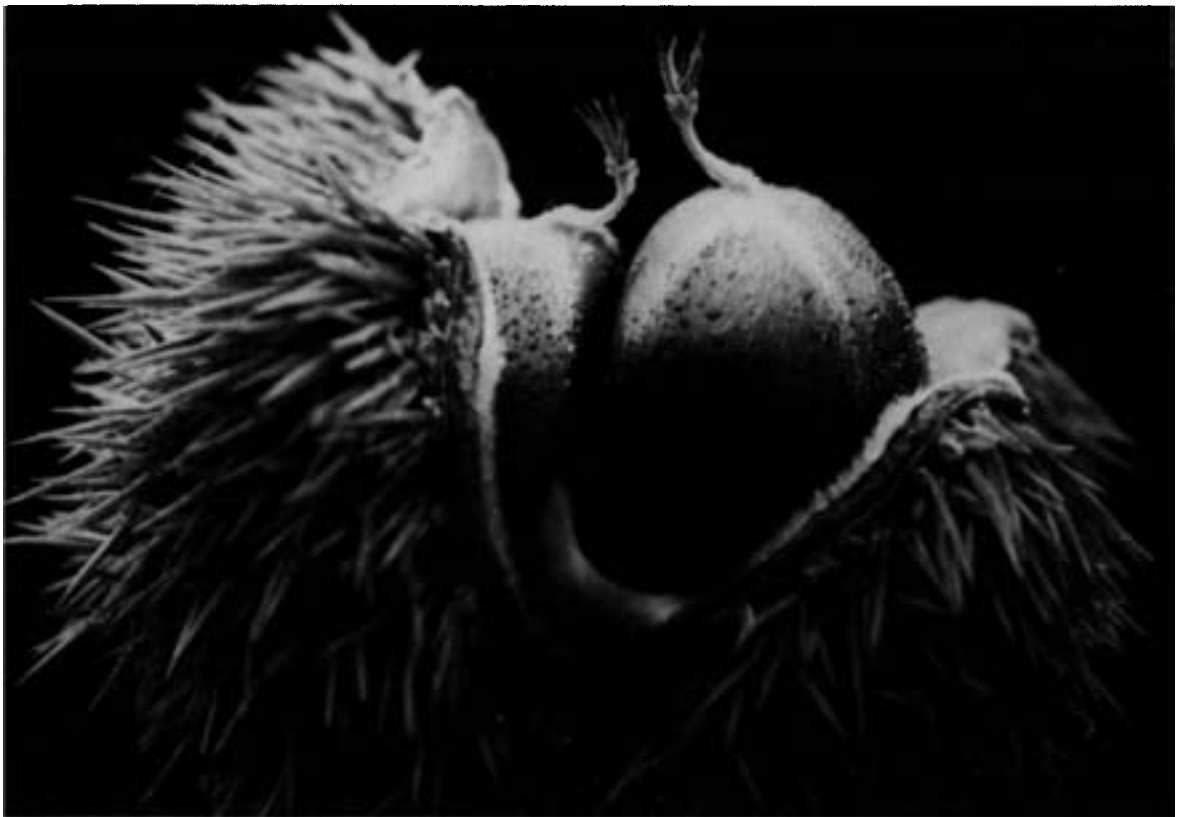
Castanea mollissima nut emerging from bur

highly for its versatile decay-resistant wood, and its nut crops provided food for humans and substantial forage for livestock and wildlife. Then came the chestnut blight in 1904. In that year chestnut trees in New York City were found dying of an unknown cause. Investigations revealed a fungal, bark-canker disease that impeded the flow of sap. Large trees often died within two years of the first infection. The chestnut blight, as the disease was called, spread outward from New York City at the rate of 20 miles per year. Eventually, it completely decimated